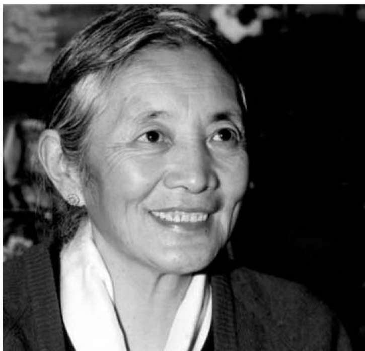
Khandro Tsering Chödrön was the spiritual wife of Jamyang Khyentse Chökyi Lodrö and is regarded as the foremost woman master in Tibetan Buddhism.