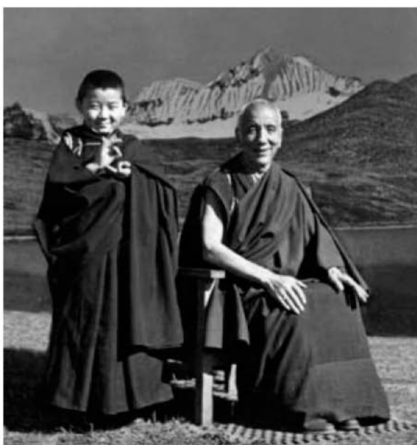
Jamyang Khyentse Chökyi Lodrö and Sogyal Rinpoche.

Jamyang Khyentse Chökyi Lodrö (1896–1959) was the most outstanding Tibetan master of the last century. Authority on all traditions and holder of all lineages, he was the heart of the ‘non-partisan’ movement in Tibet.