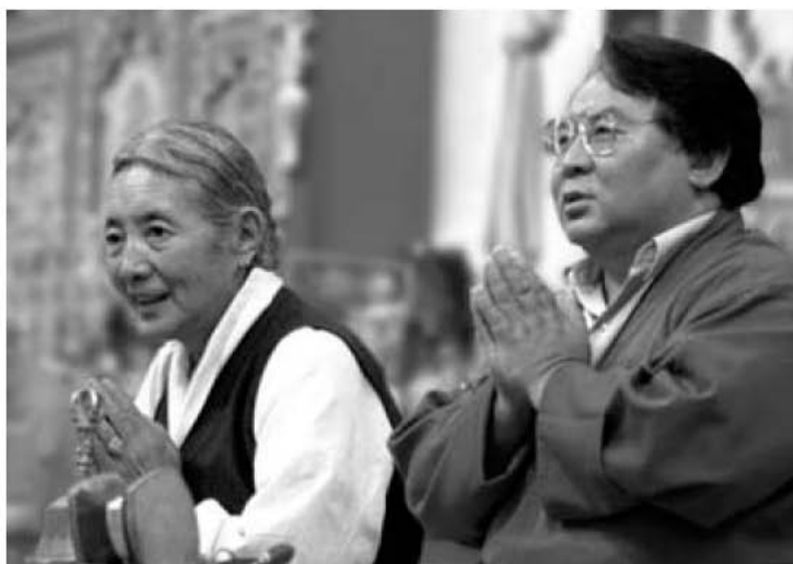
Khandro Tsering Chödrön and Sogyal Rinpoche at the Rigpa center in London, 1996.